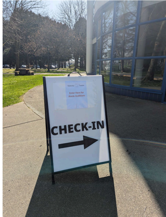
Images: (1) A paved ramp leads up to two silver-framed doors, with a sandwich board in front; (2) A close-up of the sandwich board, which reads "Enter Here for Annie Auditions" and "CHECK-IN" above a big arrow pointing to the right.