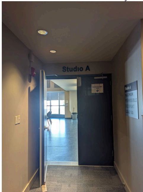
Image: A doorway leading from a carpeted hallway into an open room with windows. A sign above the door reads "Studio A."