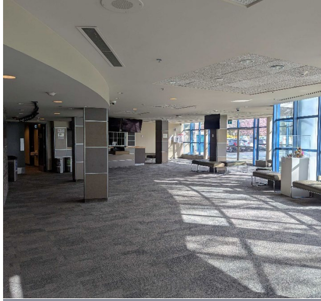
Image: An open, carpeted area with floor-to-ceiling windows and bench seating.